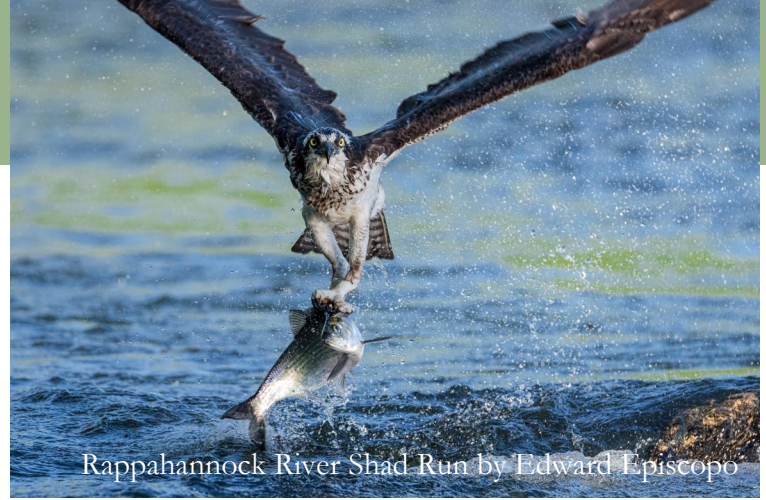
Rappahannock River Shad Run