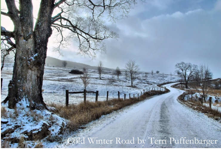
Cold Winter Road by Terri Puffenbarger