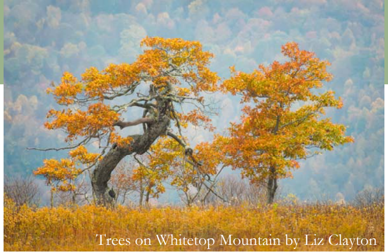
Trees on Whitetop Mountain by Liz Clayton