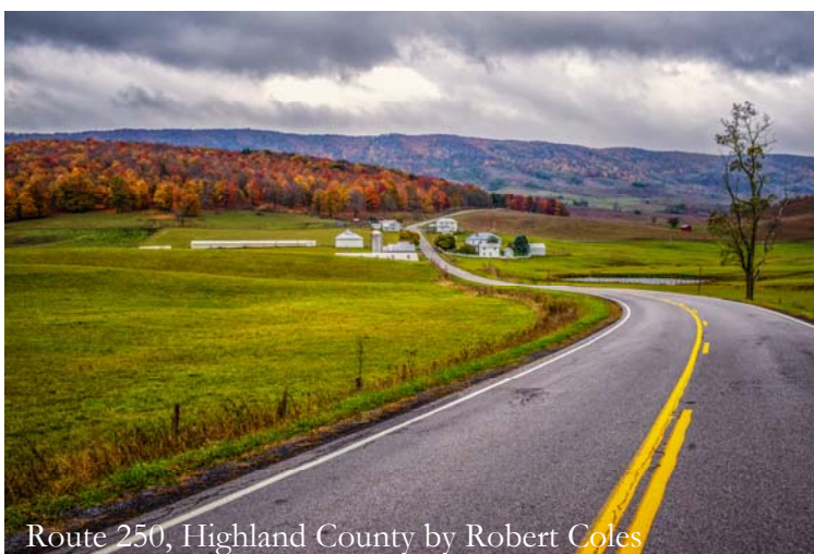
Route 250, Highland County