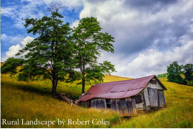
Rural Landscape by Robert Coles