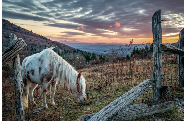
Night Life at Highlands by Will Simpson