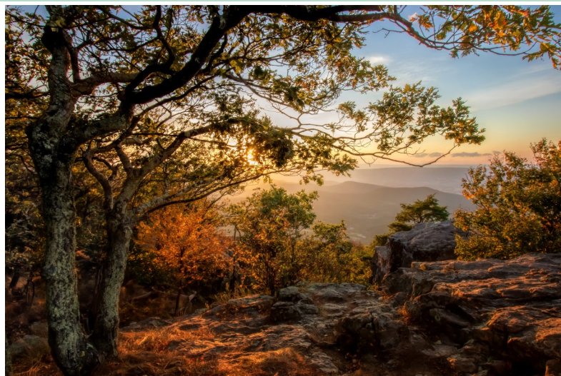
Shenandoah Sunset by Fritzi Newton