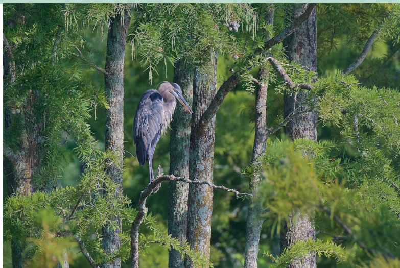
Great Blue Heron in Cypress Tree by Hugh Davenport