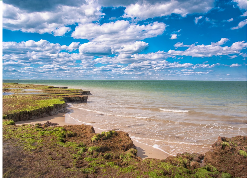
By the Sea by Florence "Flo" Womacks