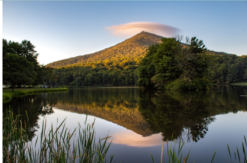
Sharp Top Sunrise and Lenticular