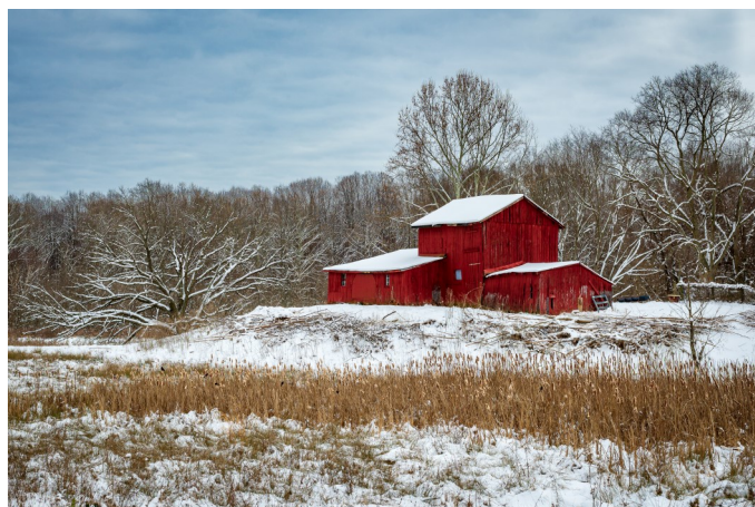
In Winter's Grasp by Esther Streusand

The ten photos featured on prior pages and below are the Winners of our 2021 Virginia Vistas Photo Contest. Notecard sets of the Winners are available for purchase by contacting Scenic Virginia using the information below. A set of ten cards (featuring one of each Winner) is $20.00 + $5.00 shipping & handling.