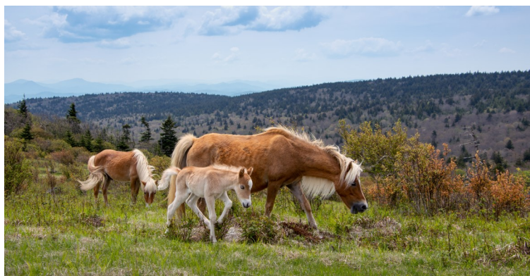
Wild, Beautiful, and Free by Florence Womacks

Scenic Virginia · 4 East Main Street, Suite 2A · Richmond, Virginia 23219 (804) 643-VIEW (8439) Phone · (866) 499-VIEW (8439) Fax · email@scenicvirginia.org · www.scenicvirginia.org