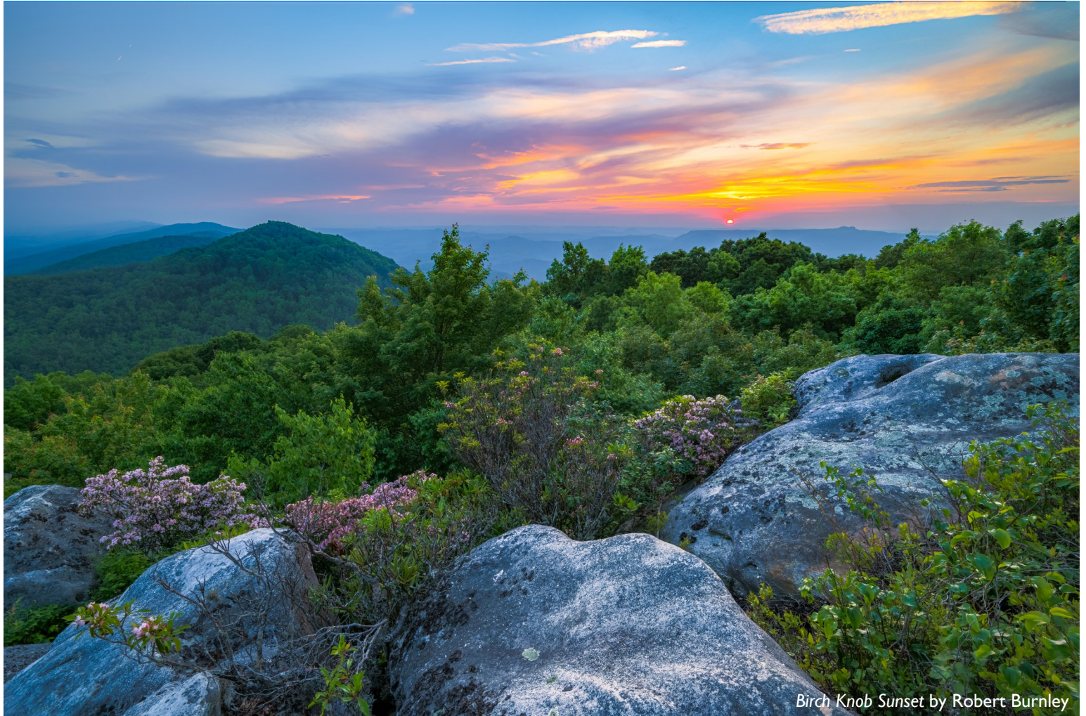
Birch Knob Sunset